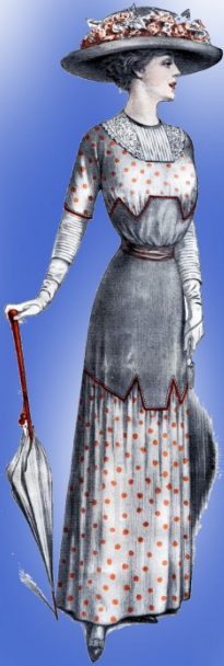
Press Cuttings by George Bernard Shaw