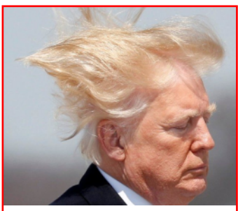
but complains the wig he was offered by the costume department makes him look a narcissistic megalomaniac.